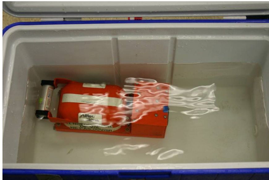
Figure 1 - CVR as Received

The NTSB Vehicle Recorder Division received an Allied Signal/Honeywell Solid State Cockpit Voice Recorder, model SSCVR part number 980-6020-001, serial number 2878. The CVR was shipped immersed in fresh water.