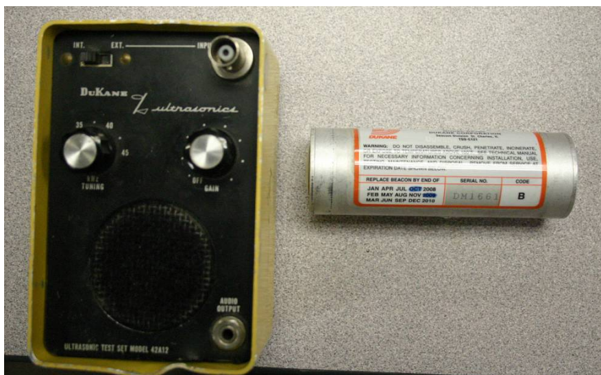
Figure 3 ULB and Test Set

The CVR had no apparent external damage, other than being wet. The underwater locator beacon (ULB Dukane Model DK100, s/n DM1661, battery expiration date October, 2009) did not function when tested. After shorting the center electrode to the case, no sound was detected using a Dukane Ultrasonic Test Set Model 42A12. The beacon was also tested using a Dukane Test Set Model TS100, which indicated “Open Probe/Batt.”