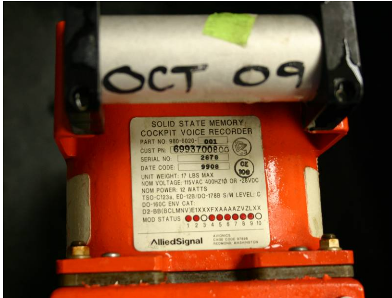
Figure 2- Data plate

The CVR had no apparent external damage, other than being wet. The underwater locator beacon (ULB Dukane Model DK100, s/n DM1661, battery expiration date October, 2009) did not function when tested. After shorting the center electrode to the case, no sound was detected using a Dukane Ultrasonic Test Set Model 42A12. The beacon was also tested using a Dukane Test Set Model TS100, which indicated “Open Probe/Batt.”